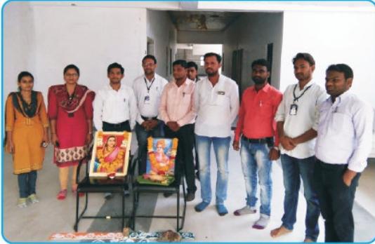
Youth Day Celebration