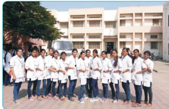
Civil Hospital Parbhani Visit.