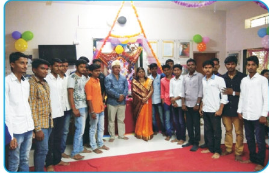
Ganpati Festival Celebration