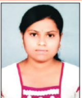
More Minakshi 79.46%