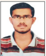
Puri Avdhut 89.91%