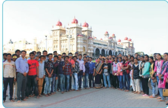
Educational Tour 2017