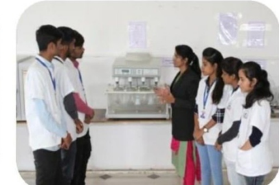
DISSOLUTION APPARATUSES (USP)