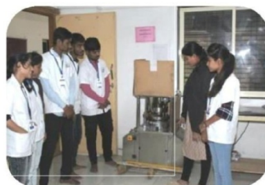
TABLET COMPRESSION MACHINE