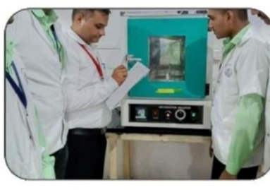
INCUBATOR SHAKER MACHINE