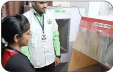
LAMINAR AIR FLOW MACHINE