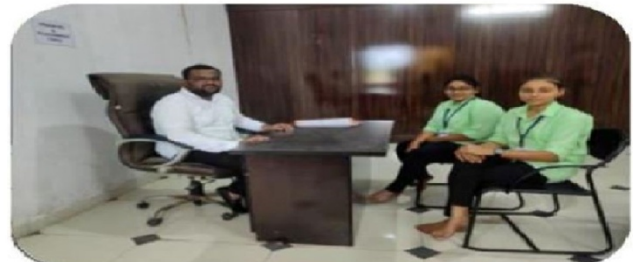
TRAINING & PLACEMENT